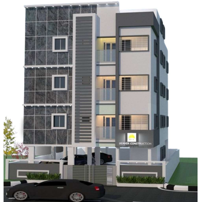
SHANMUGA - VELACHERY