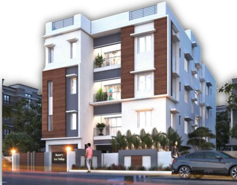
SREE VIDHYA - CHROME PET

Call: 90030 83091 | 88077 83091 | Visit: www.beavercc.in