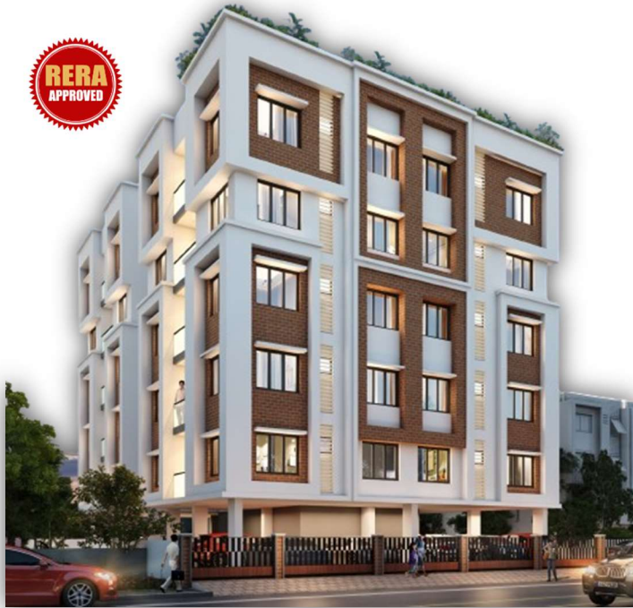
SAHANA - MADURAVOYAL